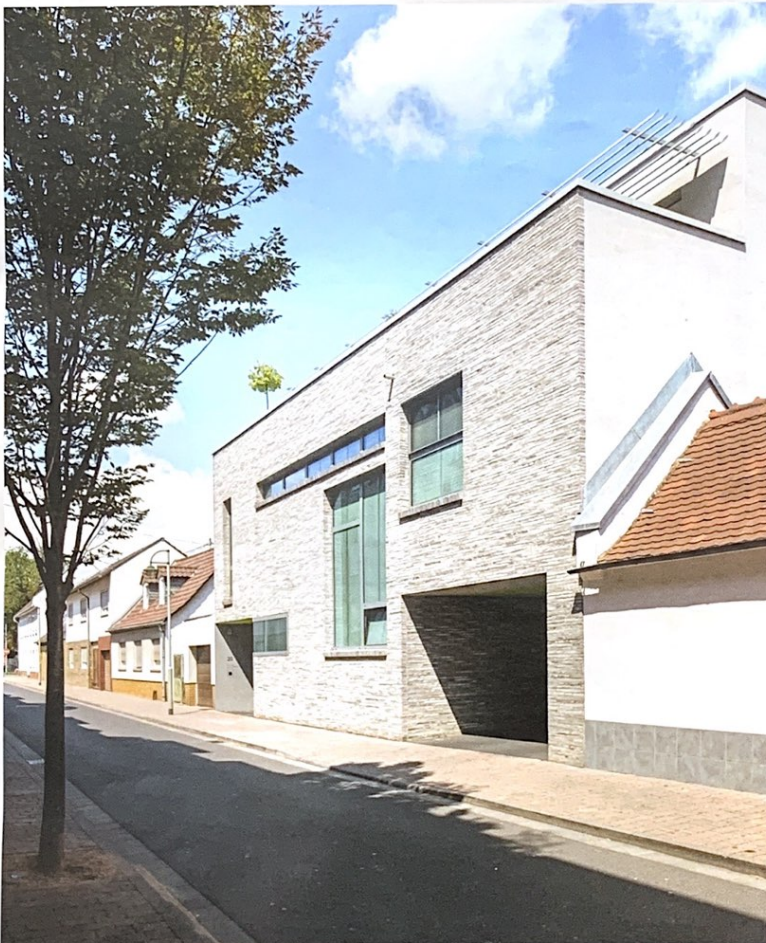
The volume of the new building harmonises with the one opposite, and the various shades of grey and white fit well with the rest of the street.

THE MATERIALS AND COMPOSITION OF THE FAÇADE ENDOW THIS DENTAL CLINIC IN HOCHHEIM WITH A MODERN IDIOM ALL OF ITS OWN, THE SIMPLICITY AND COLOURS OF WHICH HARMONISE BEAUTIFULLY WITH ITS SURROUNDINGS