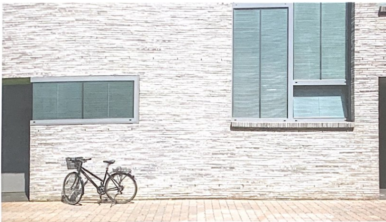
The large, double-height reception faces the street and has been designed in a relatively freeform manner.